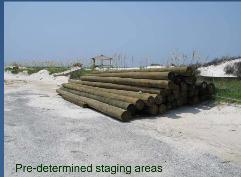
Pre-determined staging areas